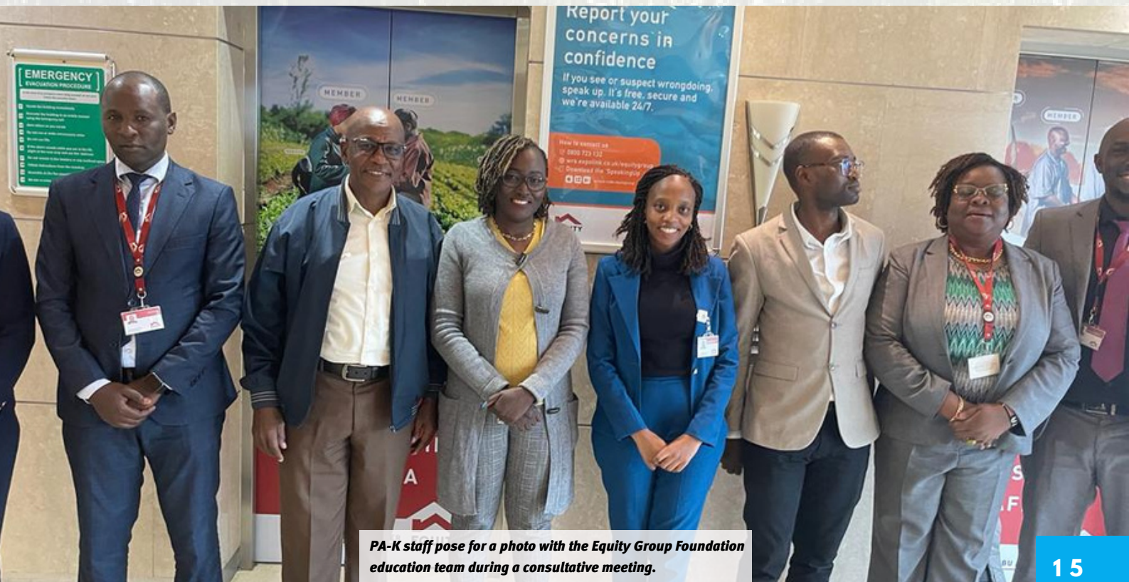
PA-K staff pose for a photo with the Equity Group Foundation education team during a consultative meeting.