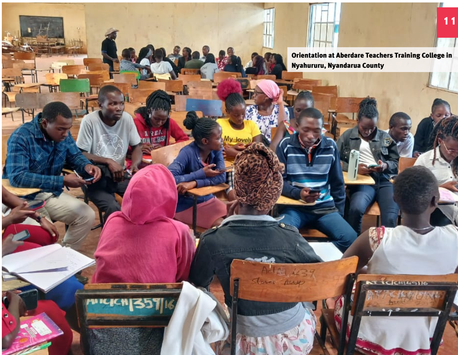
Orientation at Aberdare Teachers Training College in Nyahururu, Nyandarua County

President's Award is a program designed to challenge and inspire young people. It allows them to embrace curiosity, collaborate with their peers and enjoy the pursuit of knowledge. Let us make this exciting adventure unforgettable!