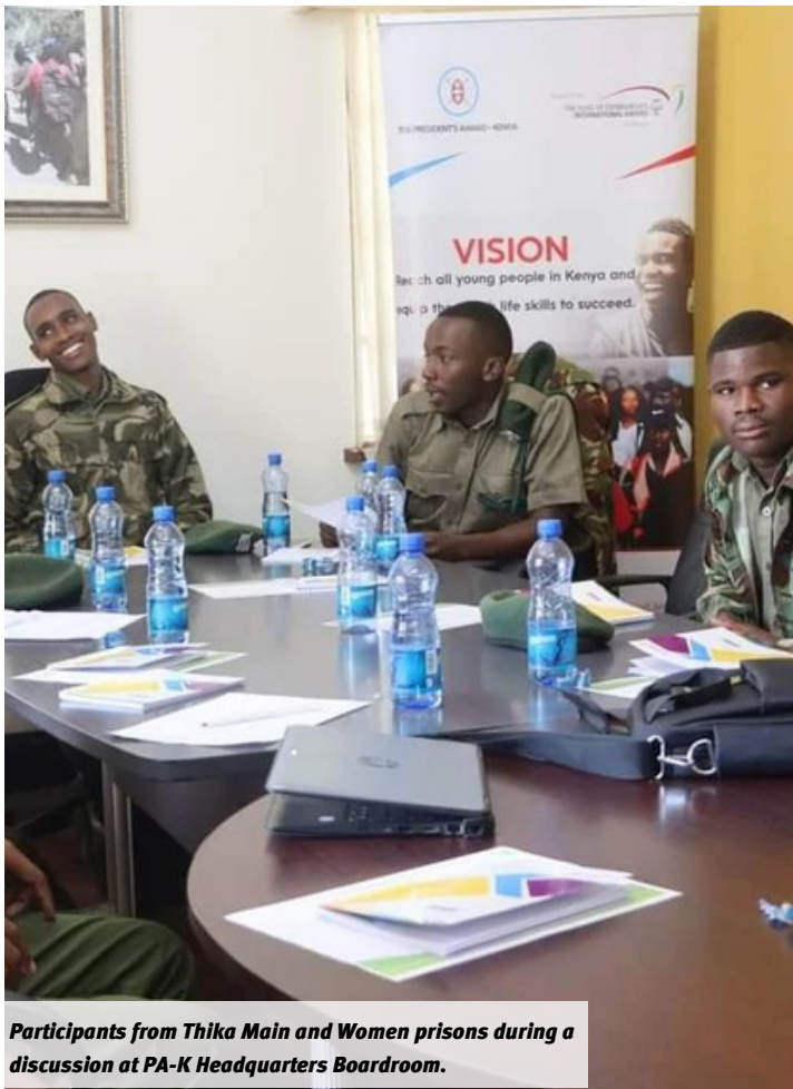
Participants from Thika Main and Women prisons during a discussion at PA-K Headquarters Boardroom.

“As you join the programme, we encourage you to be our ambassadors and speak about the programme. You have made a good decision,” she said.